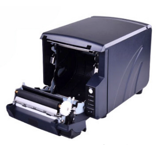
Front paper loading