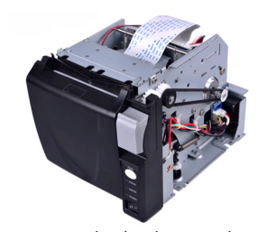
Unique belt-driven design